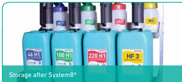
Storage after System8®