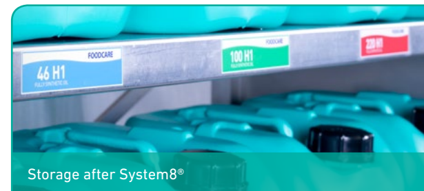
Storage after System8®